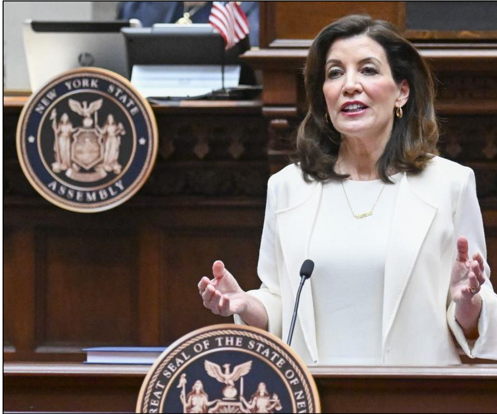
Governor Hochul delivering the 2022 State of the State address.

New York State’s ConnectALL Office (CAO) is tasked with implementing Governor Hochul’s $1B+ ConnectALL initiative, a comprehensive plan to bring affordable, reliable, high-speed broadband service to all New Yorkers.